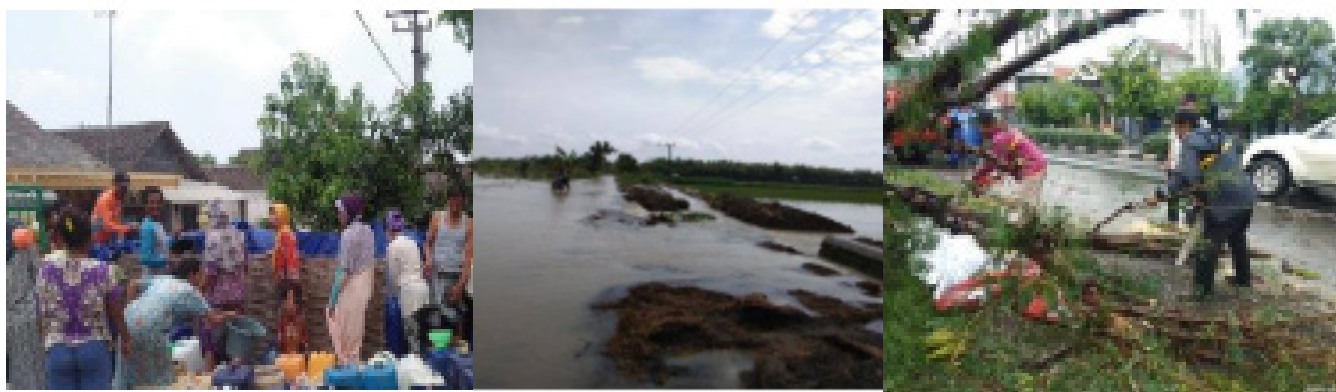
Fig. 2: Disaster events in Lamongan Regency

The integration of environmental pollution materials in schools is considered as an effort to improve students' understanding of the problems that occur in the surrounding environment. The problem of environmental pollution is capable of resulting in social and economic impacts. Thus, the learning strategy