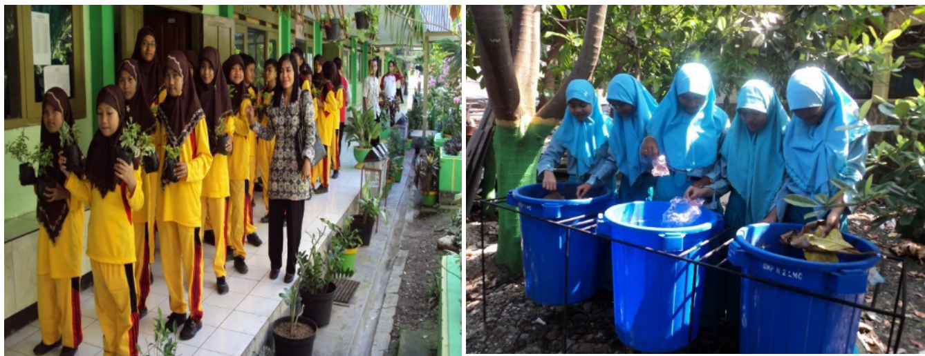
Fig. 4: Learning Activities on Environmental Pollution Materials in Schools to Anticipate Climate Change